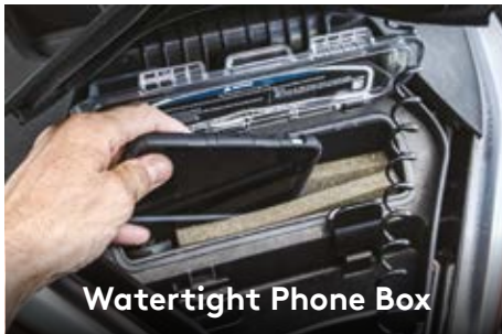
Watertight Phone Box

An innovative hull that sets the benchmark for rough water handling, stability, and offshore performance.