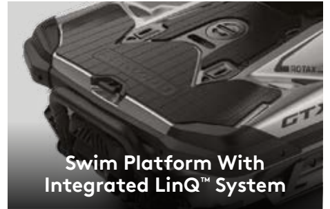
Swim Platform With Integrated LinQ™ System

The industry's first manufacturer-installed, truly waterproof, Bluetooth ‡ audio system.