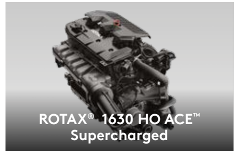
ROTAX® 1630 HO ACE™ Supercharged

Waterproof and shockproof compartment specifically designed for phone protection. 2