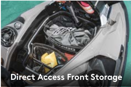
Direct Access Front Storage

Large front storage area that's easily accessible from a seated position. 1 Storage bin organizer included for ultimate convenience.