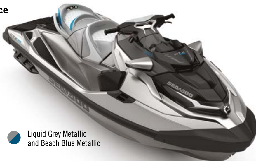
● Liquid Grey Metallic and Beach Blue Metallic