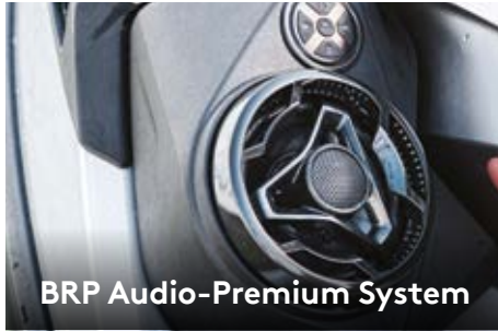
BRP Audio-Premium System

Large front storage area that's easily accessible from a seated position. 1 Storage bin organizer included for ultimate convenience.